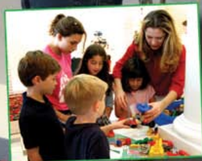
Fun & Educational Toys