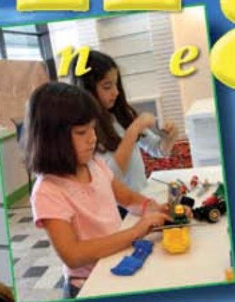
Hands On Workshops